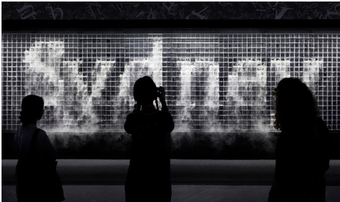
Rafael Lozano-Hemmer, Atmospheric Memory (2019).