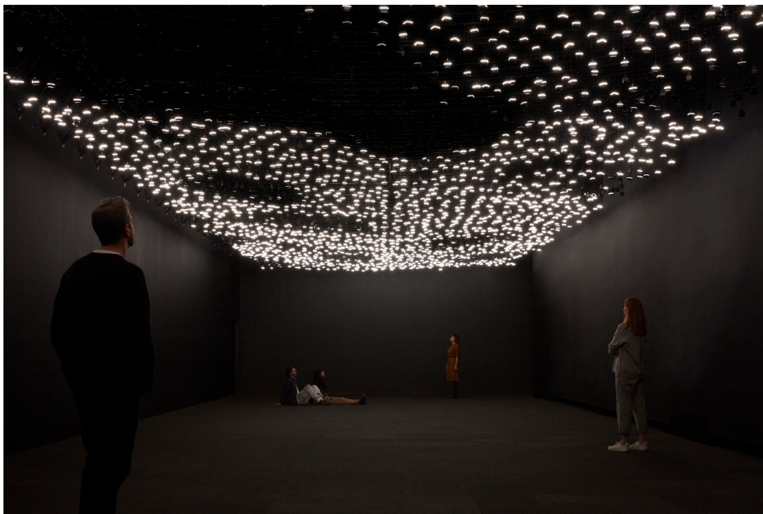
Rafael Lozano-Hemmer, Atmospheric Memory (2019).