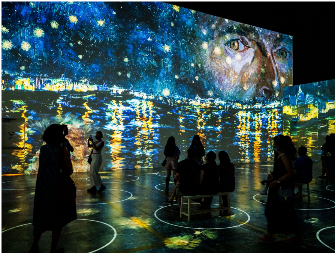
“Immersive Van Gogh” in Chicago.

By May 2022, there were over five million tickets sold ( https://news.artnet.com/art-world/investors-immersive-art-experiences-2136126 ),—or one for every 90 Americans. Today, there are permanent Lighthouse Art Space venues in Boston, Chicago, Cleveland, Columbus, Denver, Detroit, Kansas City, Las Vegas, Minneapolis, Nashville, San Antonio, and Toronto.