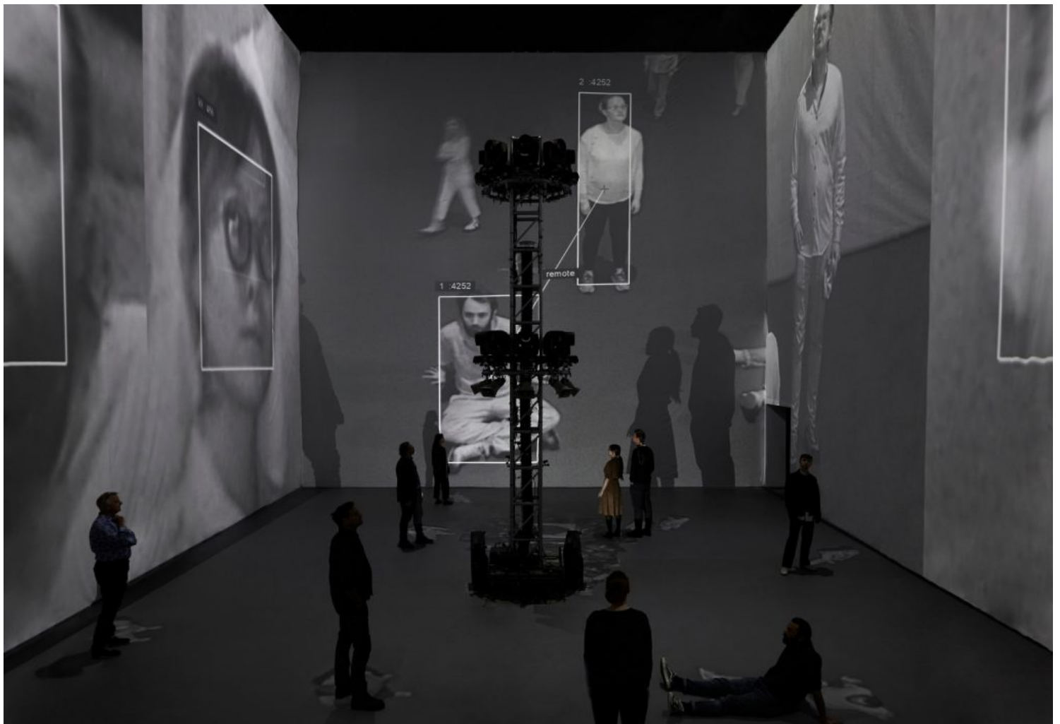
Rafael Lozano-Hemmer, Atmospheric Memory (2019).