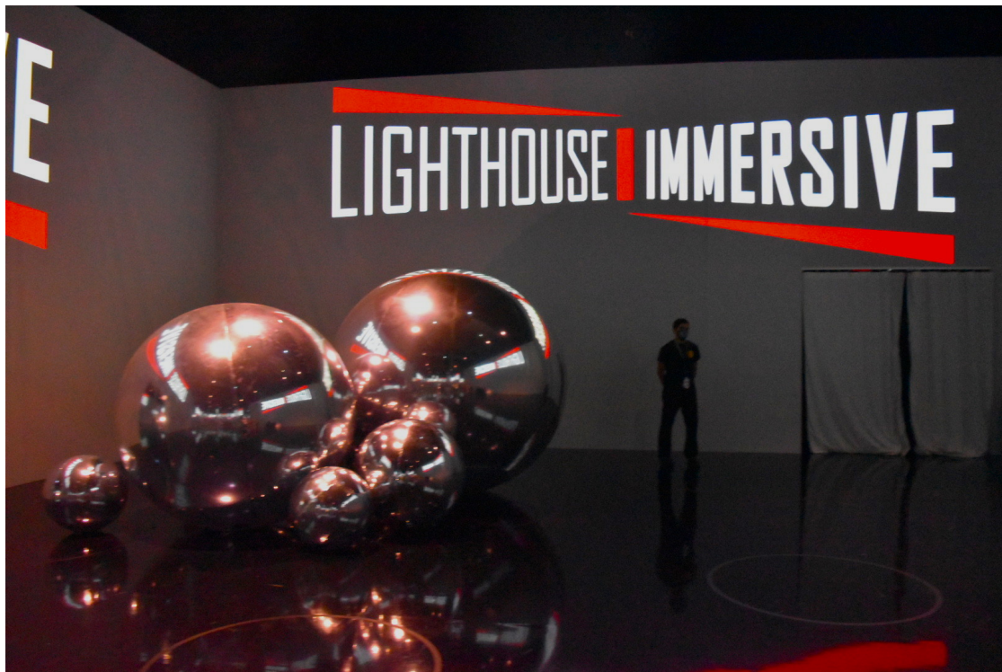
A credit for Lighthouse Immersive, the company behind "Immersive Van Gogh," within the experience.

September 4). There are currently no sold-out dates at any of the venues. The company's only other current offering is " Immersive Disney Animation ( https://lighthouseimmersive.com/disney/ )," now on view in 12 cities.