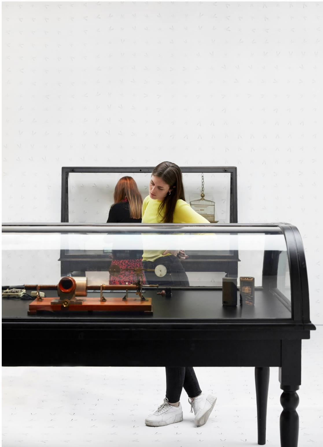
Rafael Lozano-Hemmer, Atmospheric Memory (2019).