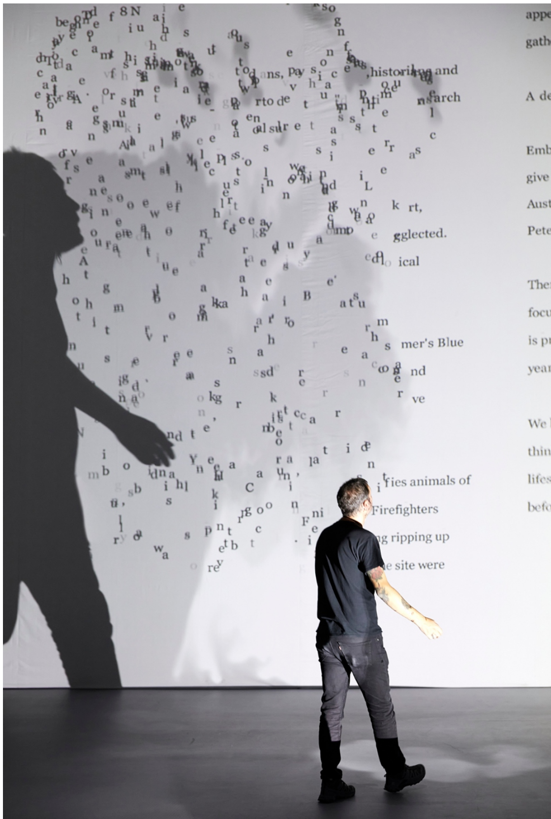
Rafael Lozano-Hemmer, Atmospheric Memory (2019).