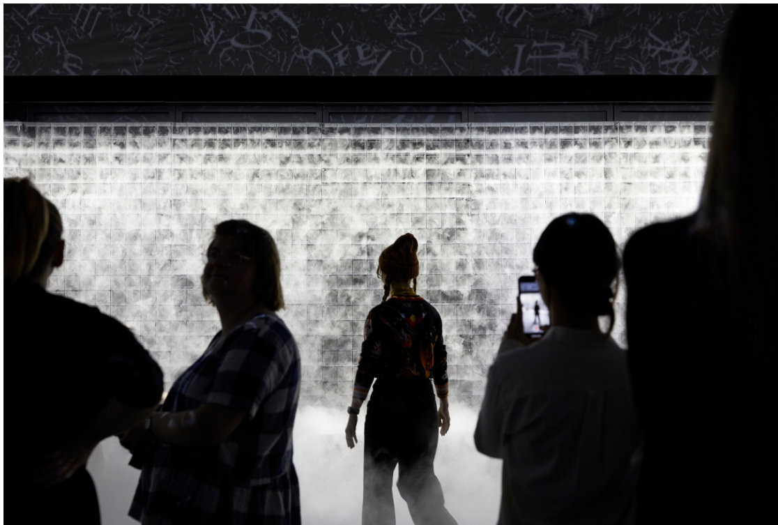
Rafael Lozano-Hemmer, Atmospheric Memory (2019).